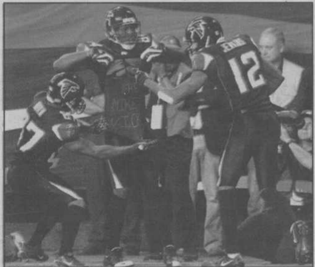
Atlanta Falcons' Joe Horn, left, and Michael Jenkins, right, help teammate Roddy White raise his jersey to display a message of support for suspended QB Michael Vick after scoring a touchdown in the second quarter of a football game against the New Orleans Saints in the Georgia Dome, last week in Atlanta. Vick is serving time for dogfighting.

— Purpose • KUUMBA — Creativity • IMANI — Faith • UMOJA — Unity • KUJICHAGULIA