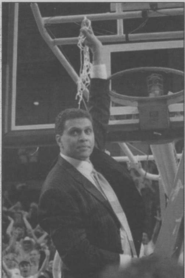
New Mexico State coach Reggie Theus cuts down the net in this file photo after his team defeated Utah State in the Western Athletic Conference hoops tournament championship game this year, at the Pan American Center in Las Cruces, N.M. Theus played for UNLV and in the NBA.

Theus, a two-time All-Star from UNLV, joined the Kansas City Kings during the (See Theus, Page 11)