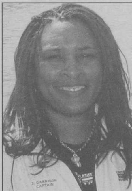
Zina Garrison looks to Fed Cup victory in 2007 and continues to serve as captain.