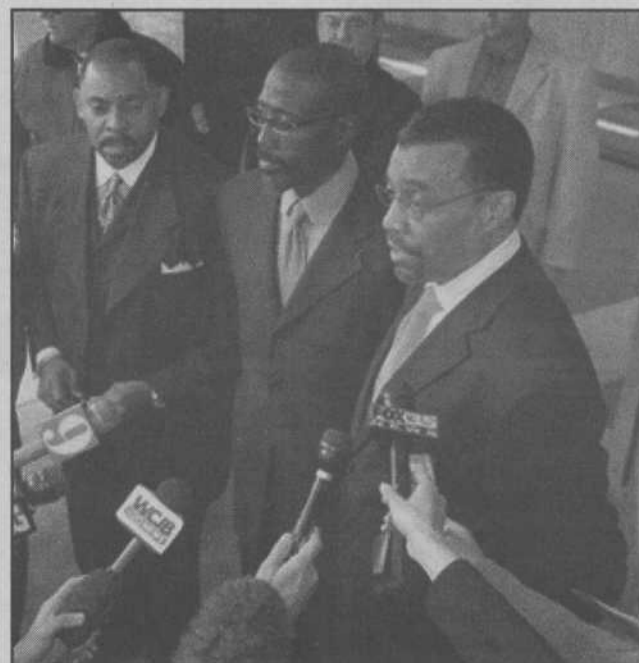
Actor Wesley Snipes (center) with his legal team in Florida. The star has pleaded not guilty to charges of tax fraud.