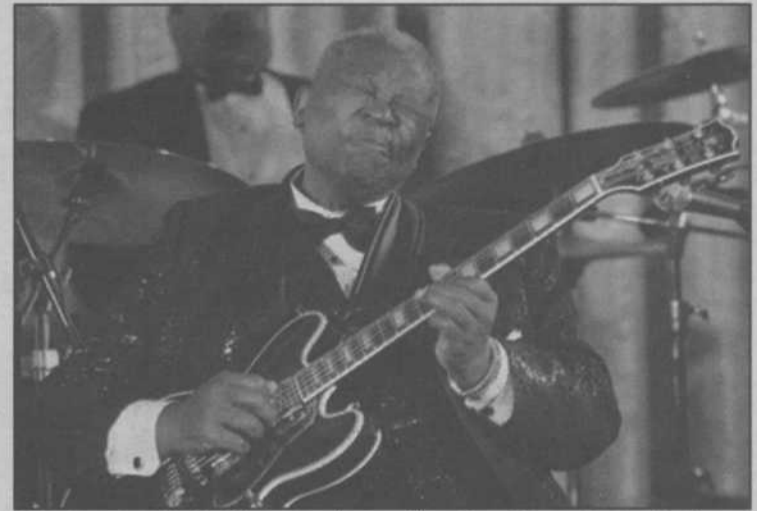
Blues great B.B. King performs for President Bush during a celebration of Black Music Month in the East Room of the White House in Washington on Monday. Bush honored Black musicians.

Bush, in turn, was given a guitar by the performers.