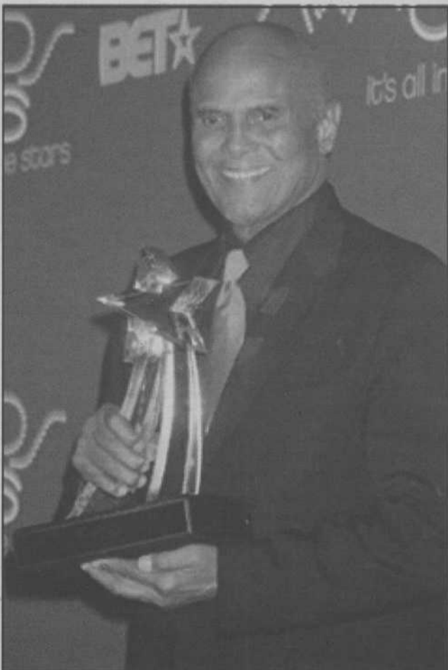
Actor, performer and activist Harry Belafonte poses with his Humanitarian award at the 2006 BET Awards in LA.

BET Award winners were decided by a panel of executives from entertainment companies, record labels and the media, except the award for Viewers' Choice, which fans voted for online. Not all award presentations were shown during the telecast.