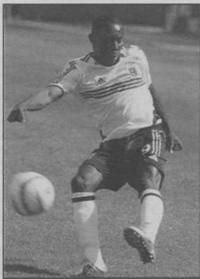
Freddy Adu, 16, has been given the option to play in the World Cup.

LOS ANGELES (AP) — U.S. coach Bruce Arena is inviting Freddy Adu to his first camp with the national team and left open the possibility that the 16-year-old could be on his World Cup roster.