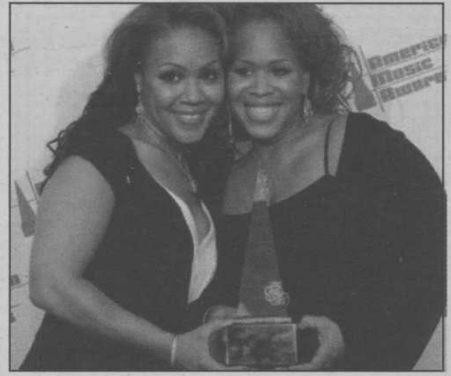
Tina Adams, left, and Erica Adams, members of gospel singing duo Mary Mary, hold their award for favorite contemporary inspirational artist backstage at the 33rd annual American Music Awards in Los Angeles on Tuesday.

"I got the new Apple Tic-Tac. It freshens your breath and plays one song," he joked on Tuesday.