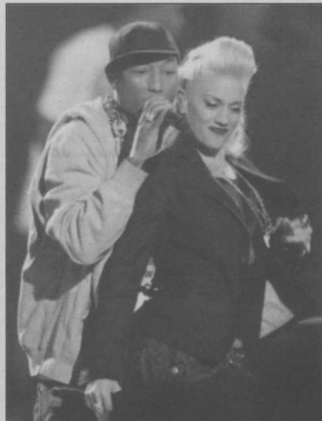
Pharrell Williams and Gwen Stefani, right, perform 'Can I Have It Like That' during the 2005 American Music Awards at the Shrine Auditorium in Los Angeles on Tuesday.

— Purpose • KUUMBA — Creativity • IMANI — Faith • UMOJA — Unity • KUJICHAGULIA