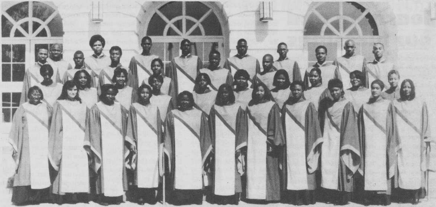
The Tuskegee University Gospel Choir is one of the 20 college groups scheduled to perform March 24-26 at UNLV's Artemus Ham Concert Hall.