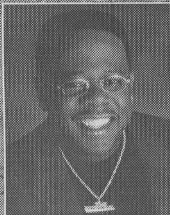
CEDRIC THE ENTERTAINER