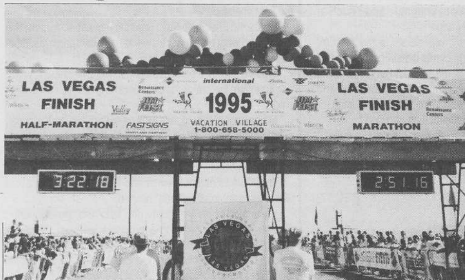
The Las Vegas International Marathon is rated as one of the top 20 marathons in the world