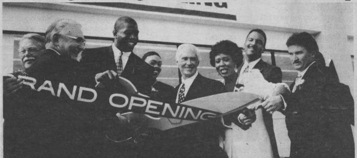
Former Laker great Earvin "Magic" Johnson returned to West Las Vegas to deliver on a promise made 3 years ago to partnership with Vons Grocery chain and build a supermarket and plaza.