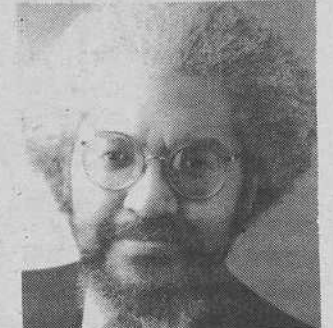
DR. MANNING MARABLE struggle for freedom and equality, to revive the vision of Martin and Malcolm, is the generational challenge for young African Americans.

Speaking truth to power means standing for a set of principles and acting courageously, finding one's own voice, struggling with joyful hope and a deep love for the promise of humanity. To continue our collective commitment to the