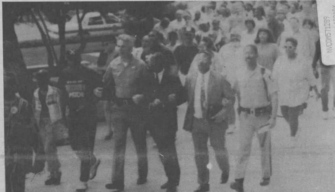
RESIDENTS JOINED COMMUNITY LEADERS, ELECTED OFFICIALS AND MEMBERS OF THE METROPOLITAN POLICE DEPARTMENT IN "UNITY MARCH."

"I don't but I've been told!" "UNITY AND PEACE IS GOLD! Am I right or wrong? YOU'RE RIGHT!" This march (See Rally, Page 13)