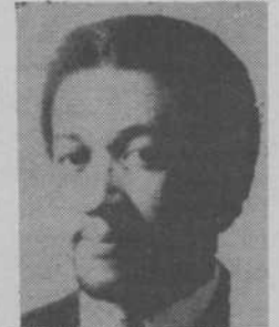
BENJAMIN F. CHAVIS, JR

African American members of Congress of the United States should demand an immediate Congressional investigation into the details that have been brought to light in the report re-