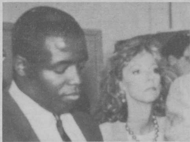
New program will work closely with the Multijurisdictional Community Empowerment Commission's Subcommittee on Employment. The MCEC was formed by Mayor Jan Jones and City Councilman Frank Hawkins after April's civil unrest.

Las Vegas Mayor Jan Lavery Jones presided over the grand opening/ribbon cutting of an occupational training center located in Nucleus Plaza, which will serve residents of the predominantly black neighborhood hardest hit by civil unrest following the Rodney King verdict. The Training Center held its opening Monday, November 9th at Nucleus Plaza, 950 W. Owens.