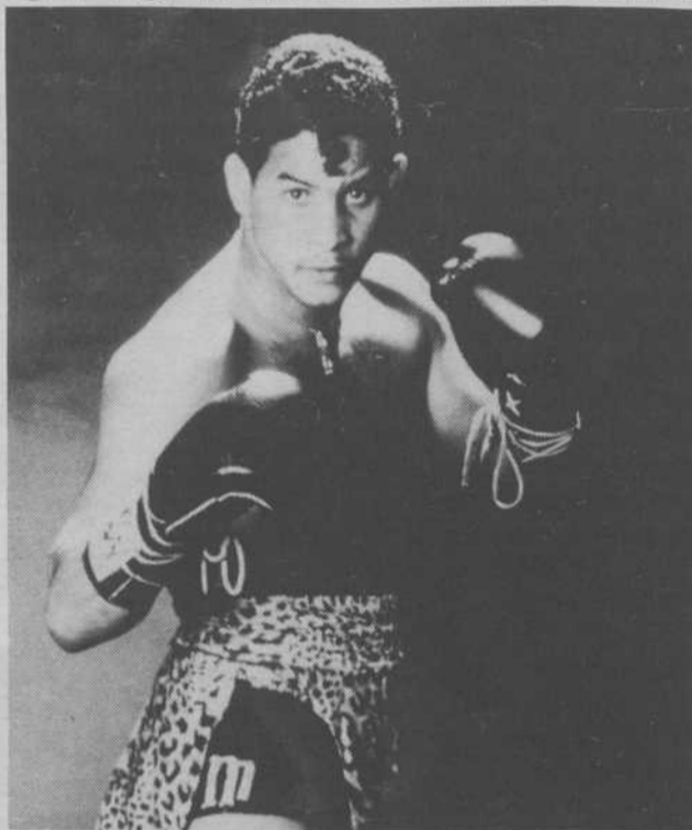
HECTOR "MACHO" CAMACHO

Tickets are priced at $300 ringside, $150 reserved and