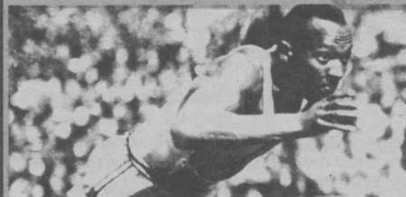
Adolf Hitler may have staged the 1936 Berlin Games as a monument to Aryan supremacy, but in the end 22-year-old Jesse Owens walked away with 4 individual gold medals.