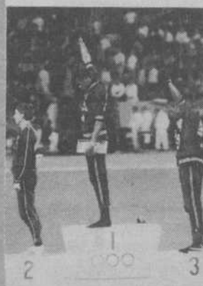
In 1968 Tommy Smith, gold and John Carlos, bronze, in Mexico City's 200 meters, were suspended, stripped of their medals, and sent home because of this famous black power salute.