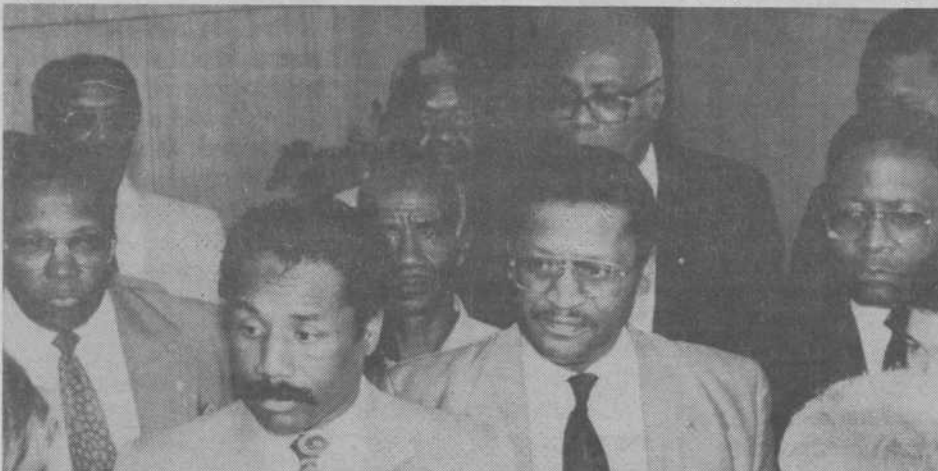
Local ministers are requesting a grand jury investigation into City Councilman Nolen's claims.