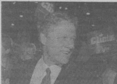
PRESIDENTIAL HOPEFUL BILL CLINTON