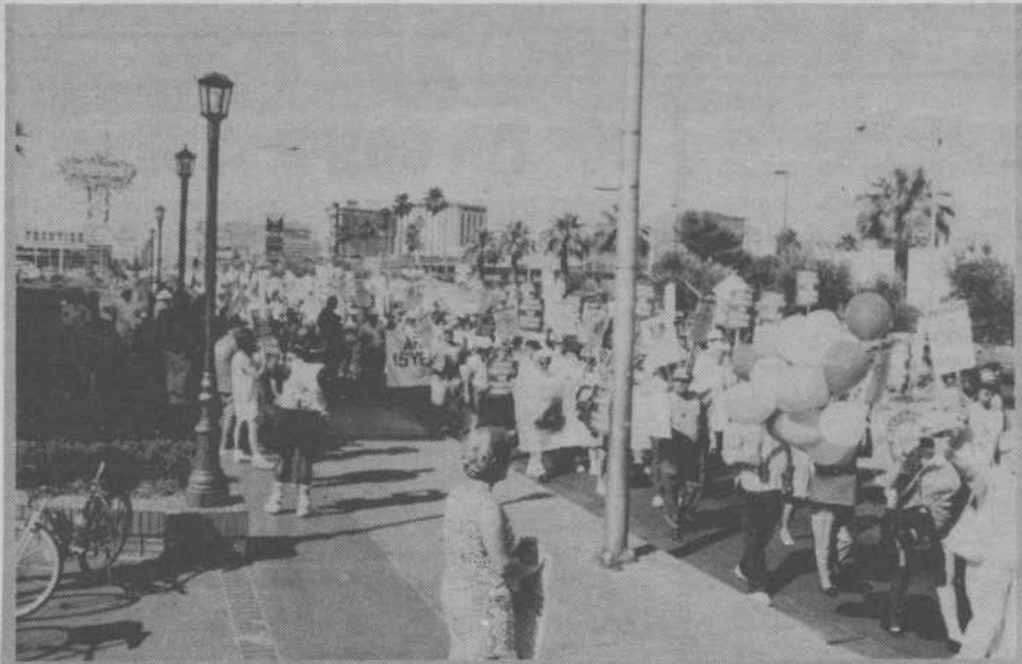
Thousands of delegates and guests of the AFSCME march along the world famous Las Vegas 'Strip' in support of the local unions fighting for a new contract at the Frontier Hotel.

Close to 3,000 members of the American Federation of State, County and Municipal Employees recently took part in a march and rally, along with members of five Las Vegas un-