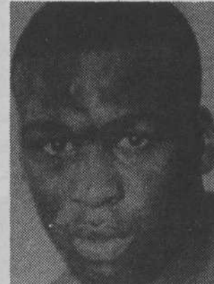
James "Buster" Douglas

Under terms of the pact, Douglas will get $25 million