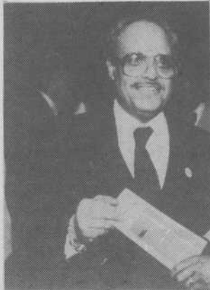
Benjamin L. Hooks

THE LETTER: -"Once again racial bigots are trying to silence the NAACP by resorting to cowardly acts of violence. Lethal mail bombs have been directed to a Federal Judge, a civil rights attorney, a federal court house and the NAACP branch