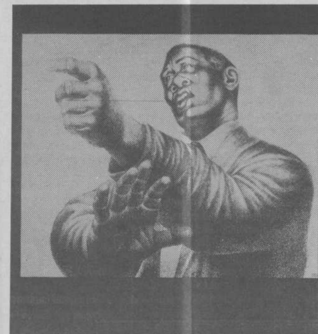
Drawing "The Preacher" by Charles White.

"The Black Arts movement is rooted in a spiritual ethic. The artists carry the past and future memory of the race, of the nation. They represent our various identities and link us to the deepest most profound aspects of our ancestry..."