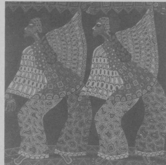
Painting "Dance Series #3 by Charles Searles.

The American Telephone and Telegraph Co.