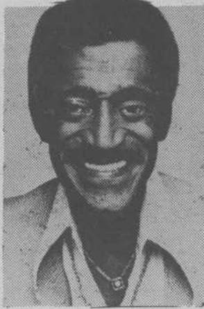
Sammy Davis, Jr.

Davis, whose name is synonymous with great showroom entertainment, has been heralded as one of the most complete entertainers of his time. A singer, actor, comedian, dancer, and impressionist, he made the top of the recording charts with "Candy Man", "What Kind of Fool Am I?", "I Gotta Be Me", and "Baretta". TV appearances include his own