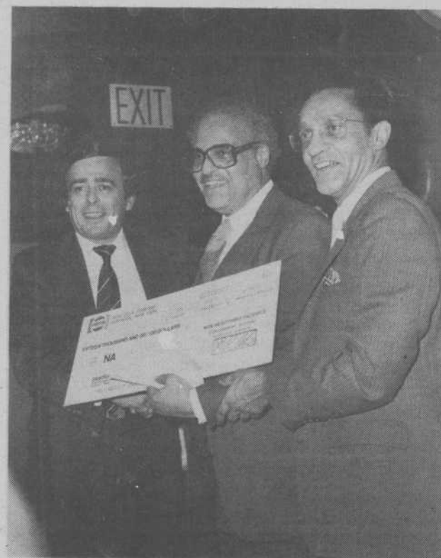
NAACP MEMBERSHIP DRIVE — Benjamin Hooks, center, Executive Director of the National Association for the Advancement of Colored People (NAACP), accepts a check for $15,000 from Pepsi-Cola USA President Roger Enrico, left, to help launch the NAACP's 1984 national membership drive. The check represented 5,000 NAACP student memberships from more than 100 historically black colleges in the United States. Tony Brown, right, award winning journalist and host of Tony Brown's Journal, the leading Black Affairs program on national television, joined in the presentation ceremonies at the St. Regis Hotel in New York City. Tony Brown's Journal, sponsored by Pepsi-Cola Company for the last nine years, will celebrate the 75th anniversary of the NAACP with a four-part series during Black History Month in February. More than 300 NAACP leaders enjoyed a premiere showing of the series during the NAACP membership drive gala in Manhattan, that also featured celebrities such as actress Diahnn Carroll, actor Ozzie Davis, and pro basketball Hall of Famer Oscar Robertson.