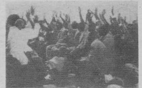
Thousands of people in Owamboland turned out to attend the DTA's political meetings that were held in the northern region of Namibia.

Seventh, it is often said that most of the civil servants in the country are whites and that there are no openings for blacks in this service. It is true that the majority of such positions at this time are held by whites, but it should also be noted that the government established in 1979 a training institute for civil servants for the sole purpose of preparing competent, young, black students as civil servants.