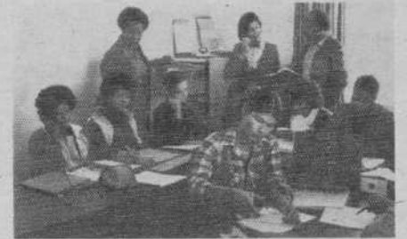
Job training and opportunities for careers increase for all Namibians.