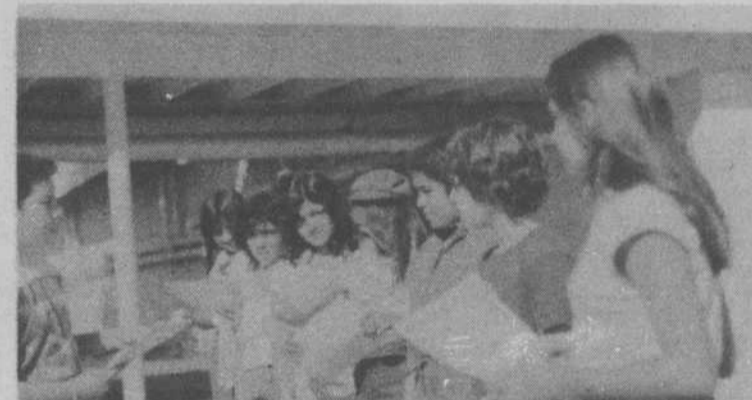
THE MEANING OF CHRISTMAS.

senior citizens at the EOB Senior Citizen Center and the Charleston Residential Hotel. This is an added attraction, which will bring a ray of sunshine into the hearts of the Senior Citizens, as they realize that they are by no means forgotten.