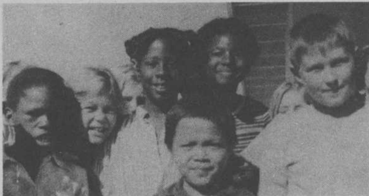
WE MADE CHRISTMAS CARDS JUST FOR YOU