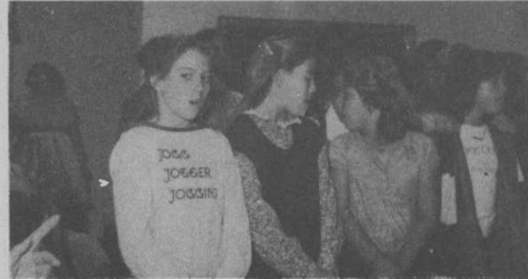
WE WISH YOU A MERRY CHRISTMAS.