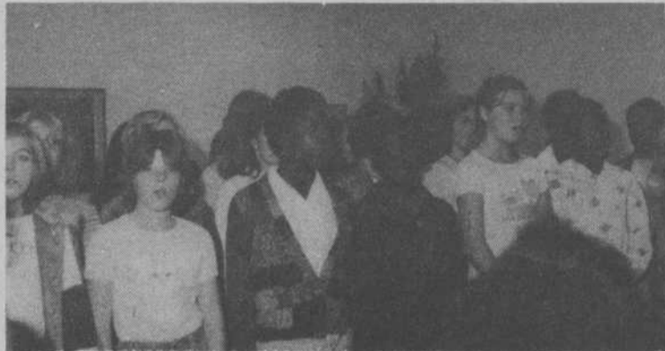
JOY TO THE WORLD, THE LORD HAS COME.

Prior to the holiday vacation, these jubilant students will be rendering a Christmas program for Senior Citizens at some of the local Senior Citizens Centers. These students in their art classes made one hundred and fifty personalized Christmas cards exclusively for the