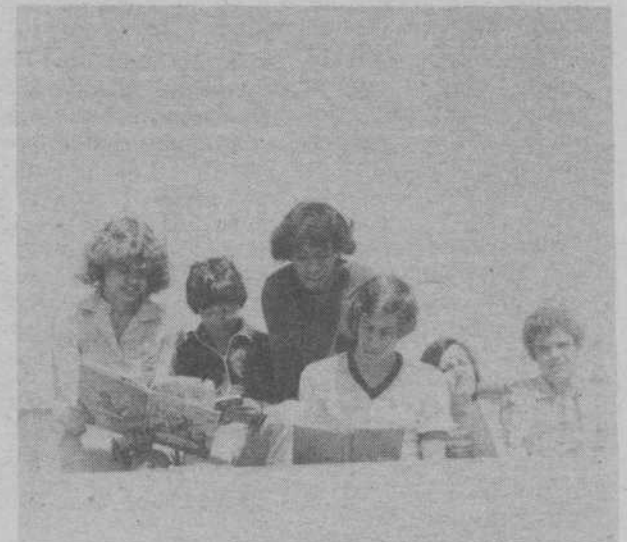
SHARING A BOOK CAN BE INTERESTING.