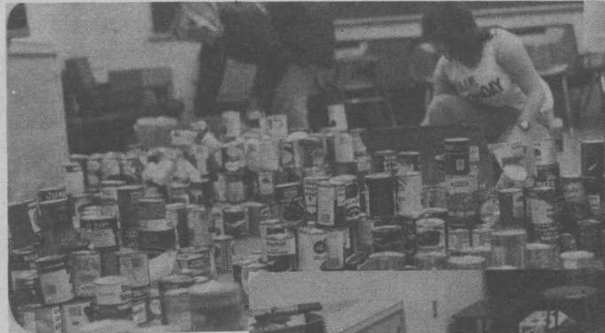
COUNTING CANNED GOODS can sometimes be a little difficult.

The Food Drive will begin October 27-November 17. If you are contacted by a student and asked to donate can goods or a non-perishable food item, remember the cause is of great importance. Being able to extend a helping hand and share, is what Human Relations is all about.