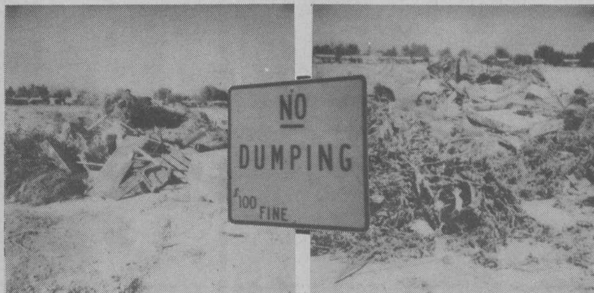
AS PICTURED JULY 18

Take a look at the pictures below. COMMUNITY PRIDE IS BEING DESTROYED BECAUSE OF CITY NEGLIGENCE.