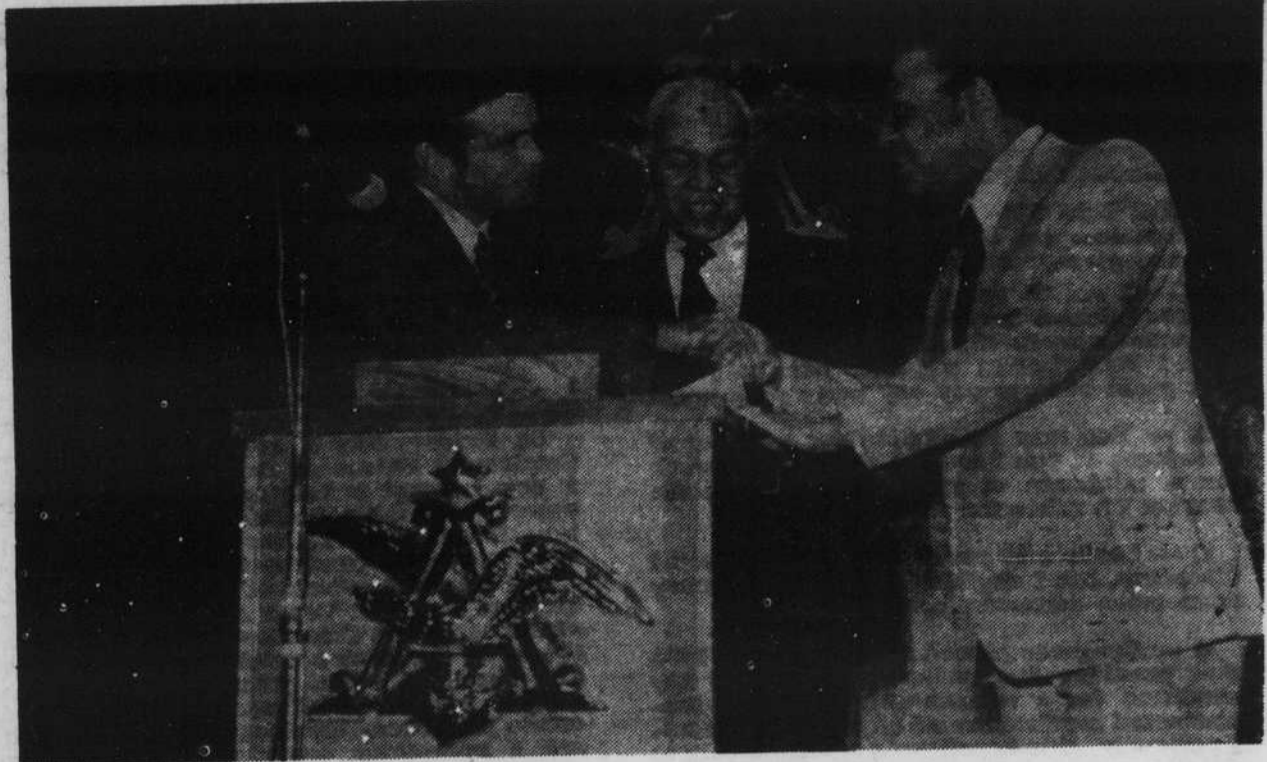
ANHEUSER-BUSCH GIFT TO NAACP. -- August A. Busch III (left), president and chairman of Anheuser-Busch, Inc., presents a $20,000 check to NAACP leaders Roy Wilkins and Benjamin L. Hooks for the creation of the Roy Wilkins College Scholarship fund.

Anheuser-Busch, Inc., has established the Roy Wilkins College Scholarship with a $20,000 grant to the NAACP.