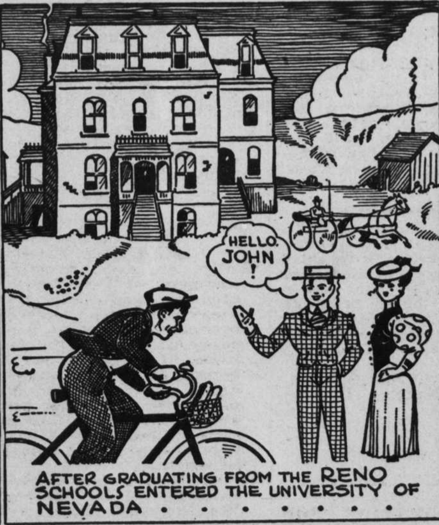
AFTER GRADUATING FROM THE RENO SCHOOLS ENTERED THE UNIVERSITY OF NEVADA.