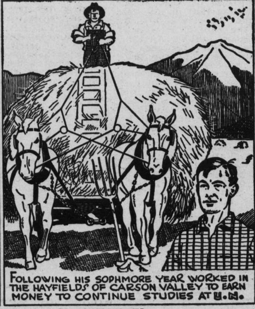
FOLLOWING HIS SOPHOMORE YEAR WORKED IN THE HAYFIELDS OF CARSON VALLEY TO EARN MONEY TO CONTINUE STUDIES AT U.N.