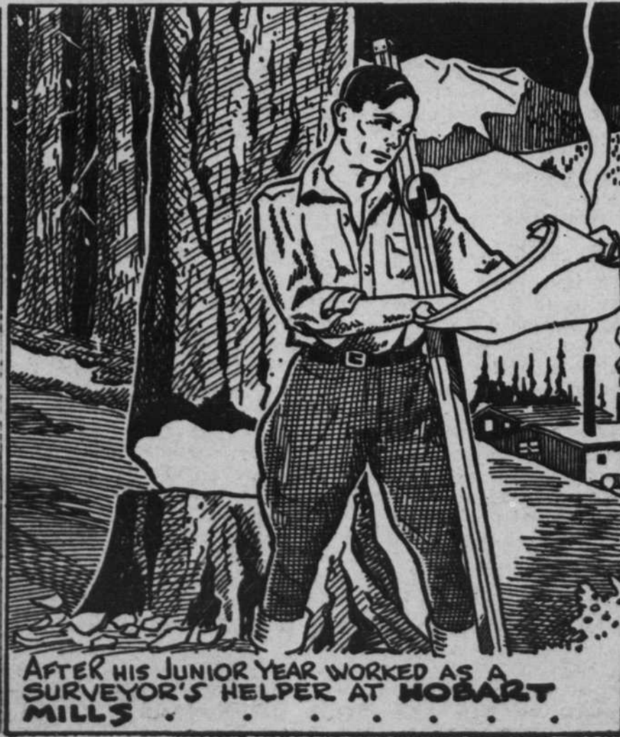
AFTER HIS JUNIOR YEAR WORKED AS A SURVEYOR'S HELPER AT HOBART MILLS.