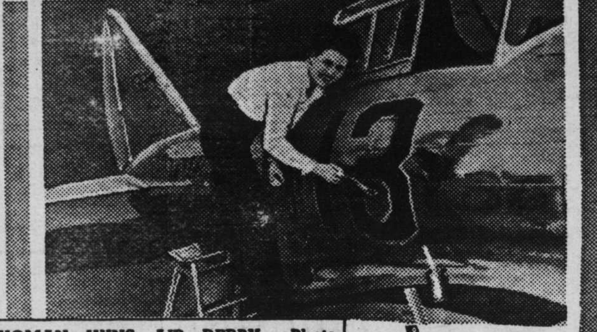
WOMAN WINS AIR DERBY —Photo shows Jacqueline Cochran painting number "13" on side of her plane which proved to be no "jinx" as it won for her $9,000 First Prize in the National Air Races held recently. Her speed averaged 249 miles an hour for the 2,042 miles, a record for women flyers.