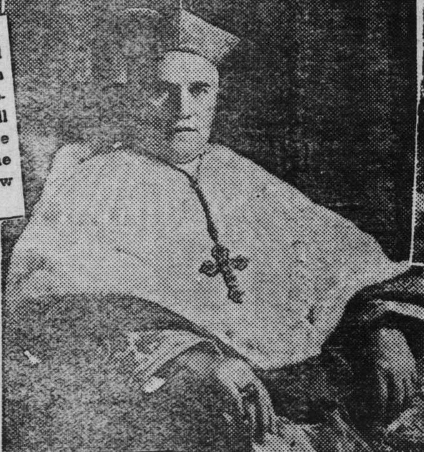
NEW YORK CITY —Patrick Cardinal Hayes, Archbishop of New York, died at his summer home at St. Josephs, New York, recently. He was 70 years old and one of the foremost prelates of United States.