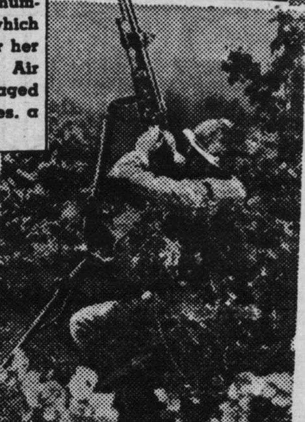
WAR TENSION GRIPS EUROPE —French troops engaged in annual maneuvers near Strasbourg which is just across the border from Kehl, German frontier village. Photo shows an anti-aircraft gun hidden in the woods as the maneuvers were held.