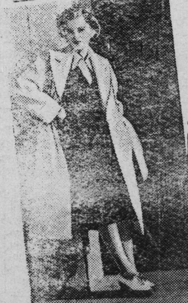
READY FOR AUTUMN —For chilly days, a heavy coat interlined for warmth. Joan Fontaine chose that classic for campus—the polo coat. She wears it over a dark brown skirt and yellow corduroy jacket.