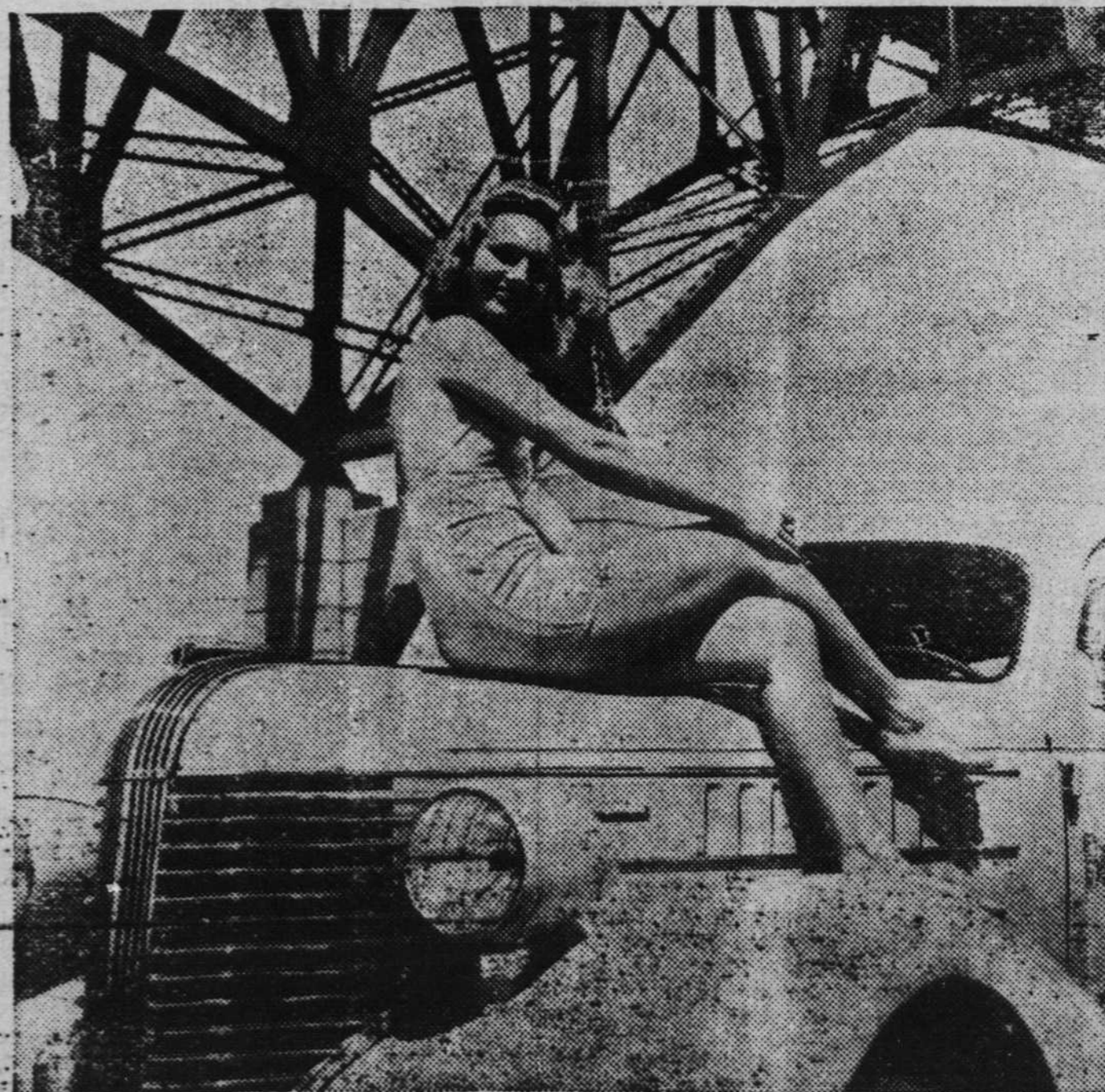
Formal dedication in September of the new Blue Water International Bridge connecting Port Huron, Mich., and Sarnia, Ont., will be marked by the presence of President Roosevelt of the United States and Governor-General Lord Tweedsmuir of Canada. The picture shows the publicity car loaned by Pontiac Motors for the ceremonies posing under the bridge span with one of Port Huron's attractive young women.