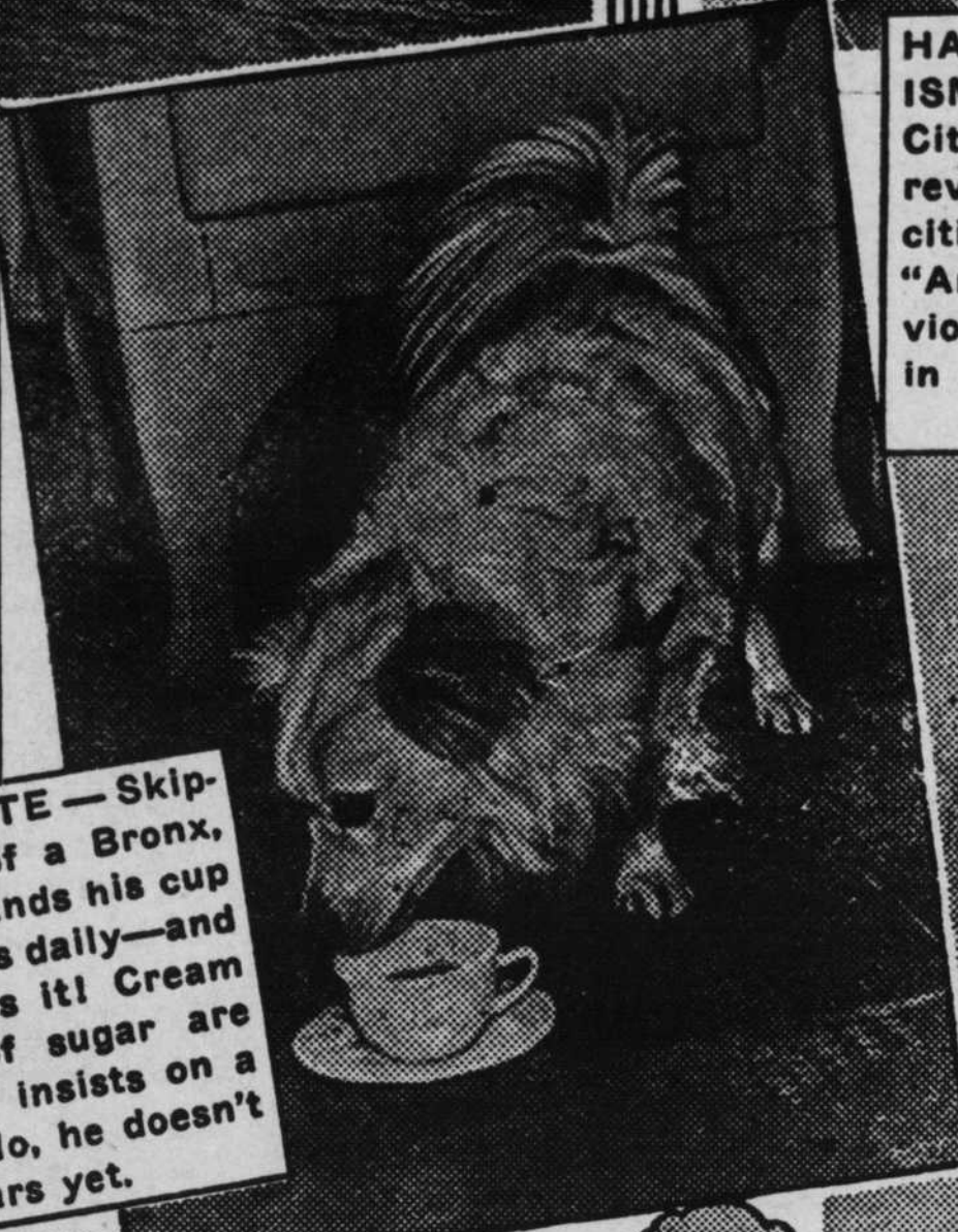
DOG SOPHISTICATE —Skippy, 5-year-old pet of a Bronx, N. Y., woman, demands his cup of coffee three times daily—and barks until he gets it! Cream and two lumps of sugar are requisites, and he insists on a cup and saucer. No, he doesn't smoke cigars yet.