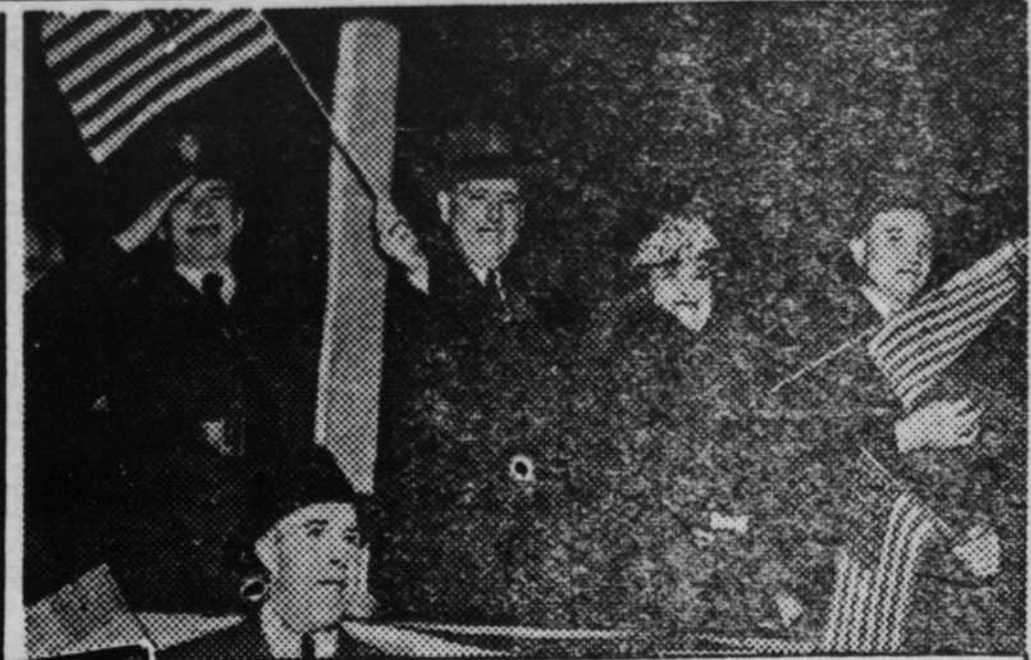
HAGUE'S "DISPLAY OF AMERICANISM" —Mayor Frank Hague of Jersey City (second from left) as he appeared reviewing huge rally by some 175,000 citizens who proclaimed Jersey City "American." Hague has been accused of violating virtually all the Bill of Rights in denying a hearing to political and Labor opponents.