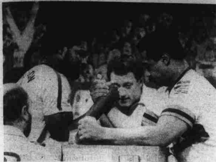
Willie Horton (R) of the Chicago White Sox, who is the 1986 defending champion in the Pro Baseball Team Arm Wrestling Tournament, is pictured here battling it out with Dave Henderson (L) of the Boston Red Sox last year. The tournament will take place at the Imperial Palace Hotel & Casino in Las Vegas December 7, 1986.

Strength, timing and will to win are the three essential ingredients in any athletic contest, but rarely does one see them so clearly as in the sport of arm wrestling. And rarely does the public have the opportunity to enjoy the sport as much as during the tournaments staged at the Imperial Palace Hotel & Casino.