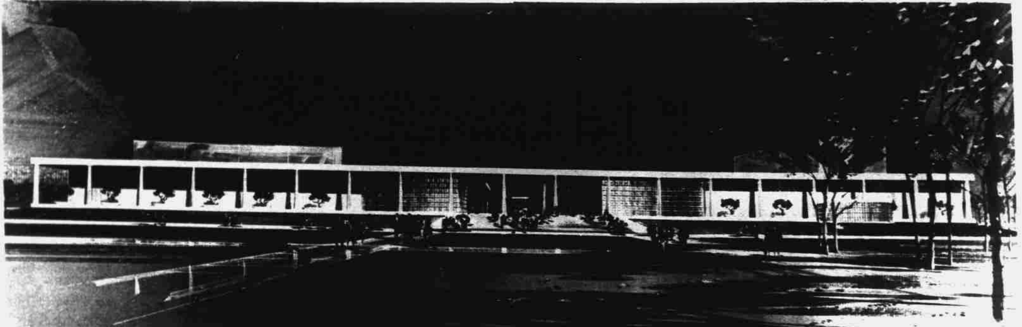
SKETCH OF THE $2.6 MILLION CENTER FOR THE PERFORMING ARTS AT THE UNIVERSITY OF NEVADA, LAS VEGAS DEPICTS A 1,500 SEAT CONCERT HALL AT LEFT AND A 600-SEAT DRAMA THEATER ON THE RIGHT, SEPARATED BY A CENTRAL PLAZA. THE COMPLEX WILL BE THE CENTRAL GATHERING PLACE FOR CAMPUS AND COMMUNITY CONCERTS, DRAMATIC EVENTS. ARCHITECT JAMES B. McDANIEL SAID CONSTRUCTION SHOULD BEGIN NEXT MARCH.