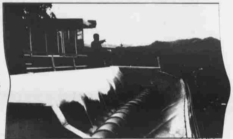
Ken Boek points to the grape auger where grapes are processed.

The private tour included a video presentation and tasting of not only Korbelt Champagne, but champagnes of different