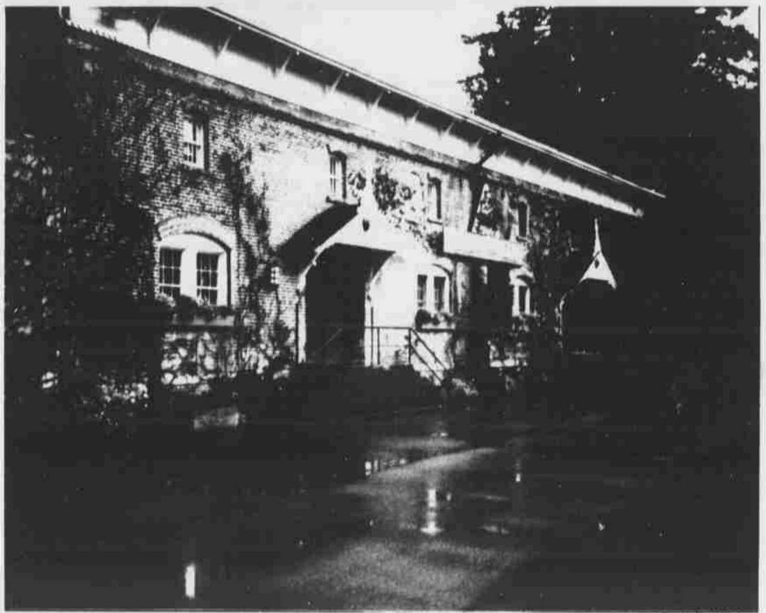
Korbelt Winery is located in Sonoma County, Napa Valley.

The combination pub-restaurant features homestyle