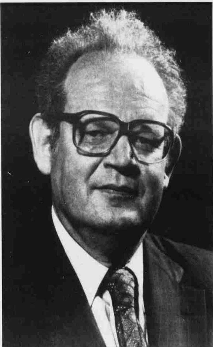
COMING EVENTS : Dr. Benoit Mandelbrot, 1991 Nevada Medal Winner, will lecture at UNLV on March 18.