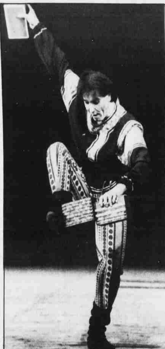
The Soviet Acrobatic Revue was part of the celebrations at Caesars Palace for the Chinese New Year.