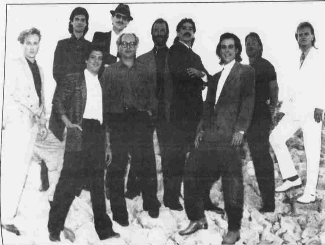
Tower of Power

Tower of Power will perform Saturday at 9 p.m. at Calamity Jayne's.