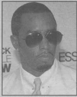
Sean "Diddy" Combs