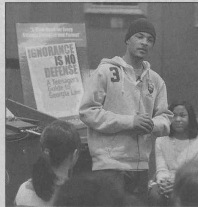
Grammy Award-winning Atlanta rapper T.I. will serve 366 days in jail for his conviction on federal weapons charges.