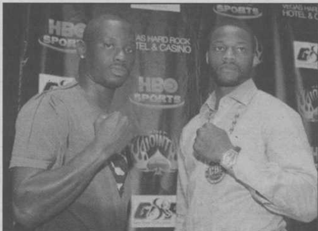
IBF light heavyweight champion Chad Dawson, right, and Antonio Tarver pose for photos after a news conference in Las Vegas on Tuesday. The heated rivals will fight in a IBF light heavyweight title boxing match on Saturday, May 9.

LAS VEGAS — The new Joint will be jumpin'! Undefeated IBF/IBO light heavyweight champion Chad Dawson and three-time world champion Antonio Tarver will meet in a rematch of their world title fight, Saturday, May 9, in The Joint at the Hard Rock Hotel & Casino Las Vegas. The fight will be televised live on HBO World Championship Boxing.