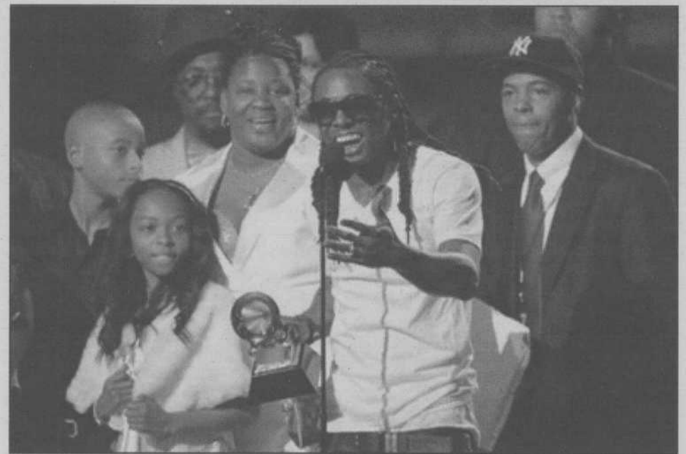
Lil Wayne, pictured with family and friends, took home four Grammy Awards on Sunday.