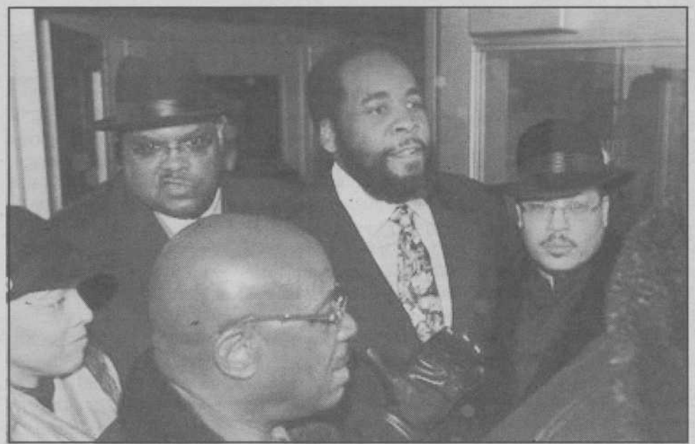
Former Detroit Mayor Kwame Kilpatrick, center and at rear, leaves the Wayne County Andrew C. Baird Detention Facility in Detroit on Tuesday after serving 99 days in lock up.