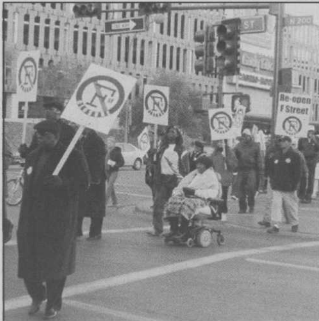
In a strong sign of support, members of Ward 5 marched to City Hall in Downtown Las Vegas to object to the closure of F Street in the Historic Westside on Wednesday morning.

“It handcuffs me as a representative,” he said. “Now it's stuck in the court's hands. Unfortunately, this particular item was buried and it got passed. In the future, we'll have to keep a closer eye to avoid things like this again.”