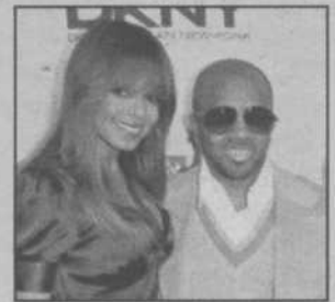
Janet Jackson and Jermaine Dupri

(TMS) Producer Jermaine Dupri took to his Internet blog last week to deny rumors that his pop star girlfriend Janet Jackson was pregnant. The pregnancy rumors flared up again recently when Jackson cancelled several of the concerts on her North American "Rock Witchu" tour. Many fans rejected the official explanation that Jackson was suffering from vertigo. Dupri told those fans, "I hear y'all and your questions ... No she is not pregnant, and yes we are still together." The latter part of that answer was aimed at rumors that the two had ended their five-year relationship.