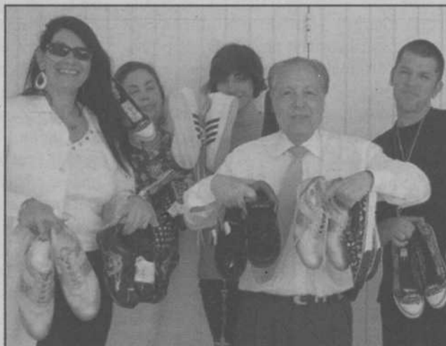
The West Las Vegas Library is hosting its annual shoe drive.