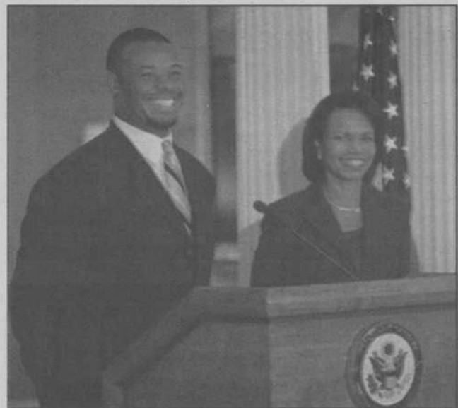
Baseball superstar Ken Griffey Jr., left, is introduced by Secretary of State Condoleezza Rice as a new U.S. envoy.