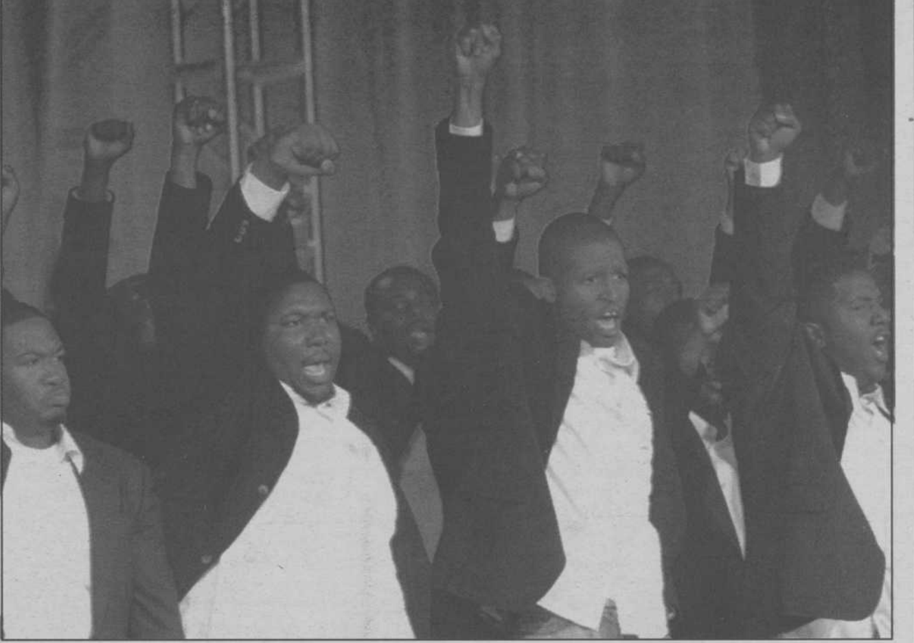
Benedict College Gospel Choir