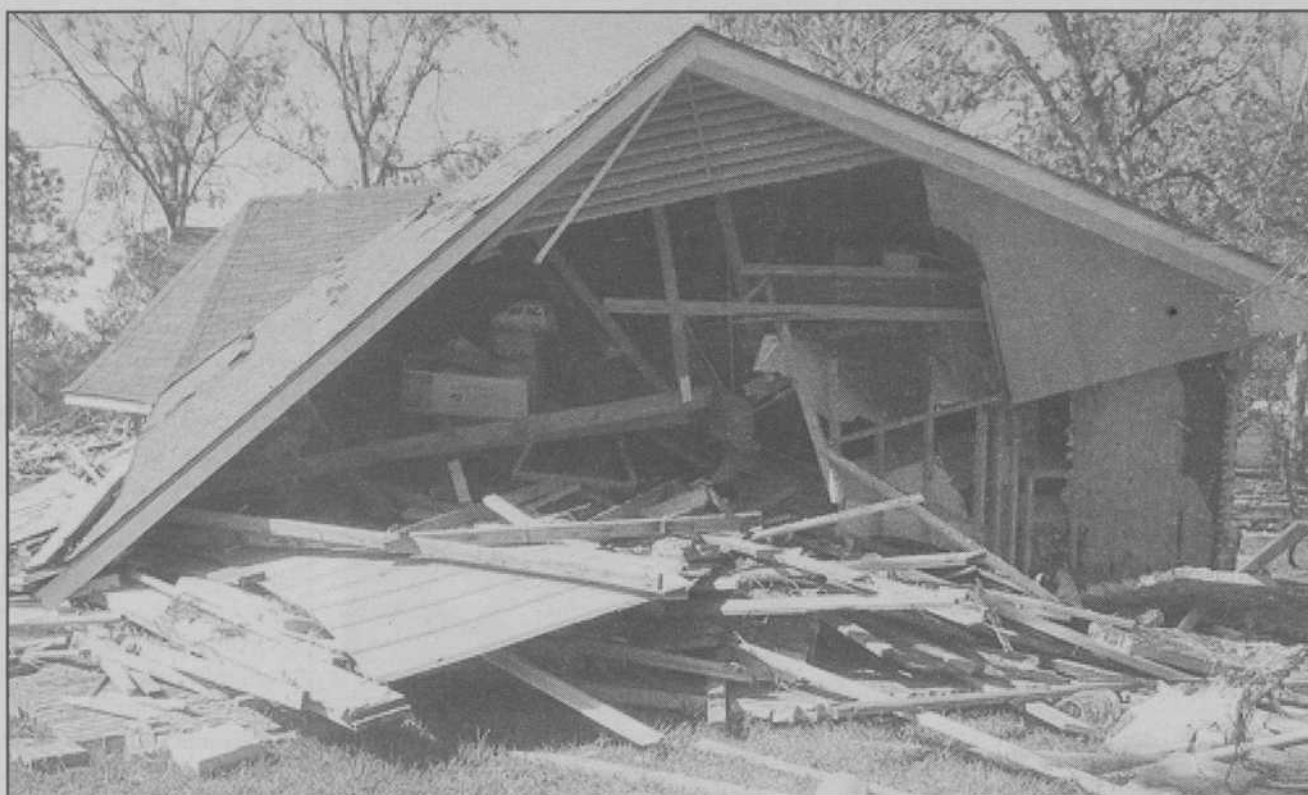
This home was symbolic of the destruction that Hurricane Katrina wrought throughout the Gulf Coast in August 2005.

A Louisiana Road Home spokesman said the program has given additional awards to 49,824 applicants earning